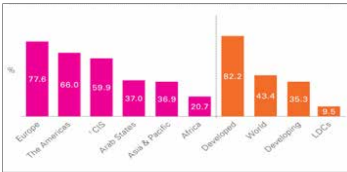
Figure 2: Percentage of Individuals Using the Internet